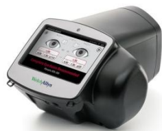
Spot Screening Device